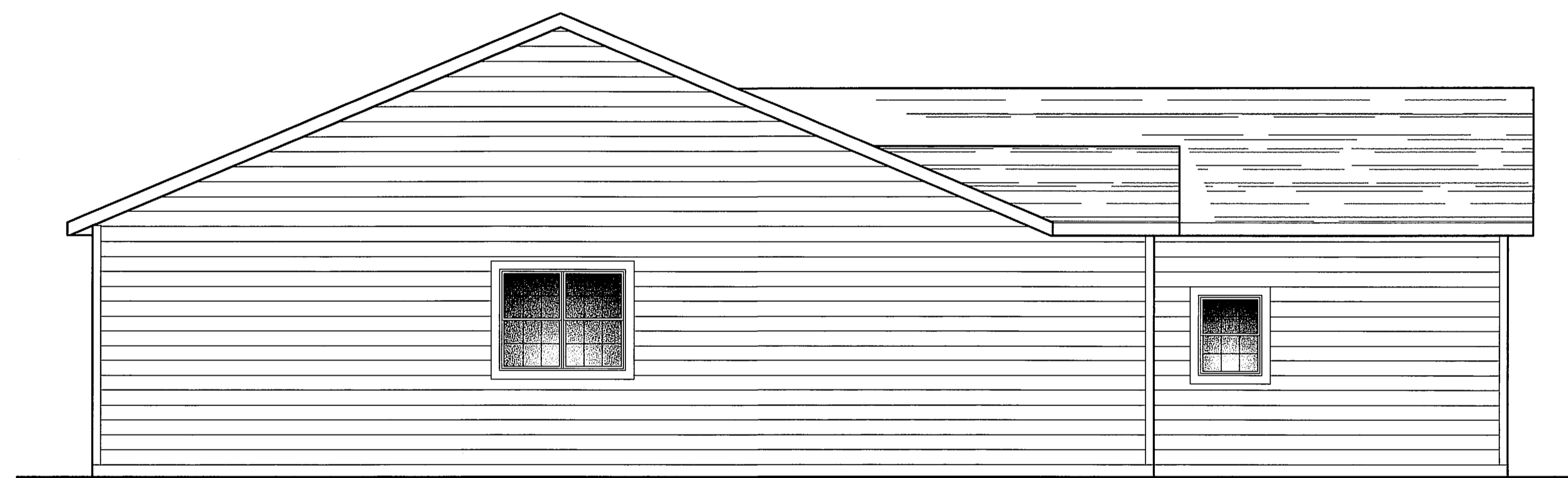
NORTH ELEVATION SCALE: 1/4" = 1'-0"

PLEASE NOTE: ALL CURRENT FEDERAL, STATE AND LOCAL CODES, ORDINANCES AND REGULATIONS, ETC. SHALL BE CONSIDERED AS PART OF THE SPECIFICATIONS OF THIS BUILDING AND ARE TO BE ADHERED TO EVEN IF THEY ARE IN VARIANCE WITH THE PLAN. THE ASSISTANCE OF A LOCAL ENGINEER MAY BE NECESSARY TO COMPLY WITH CODES AND/OR BUILDING SITE CONDITIONS. DESIGNER ASSUMES NO RESPONSIBILITY OVER ANY PHASE OF CONSTRUCTION OR COMPLETED BUILDING. OWNER ASSUMES RESPONSIBILITY FOR ALL STRUCTURAL ENGINEERING REQUIRED TO COMPLETE DESIGN OF STRUCTURE.