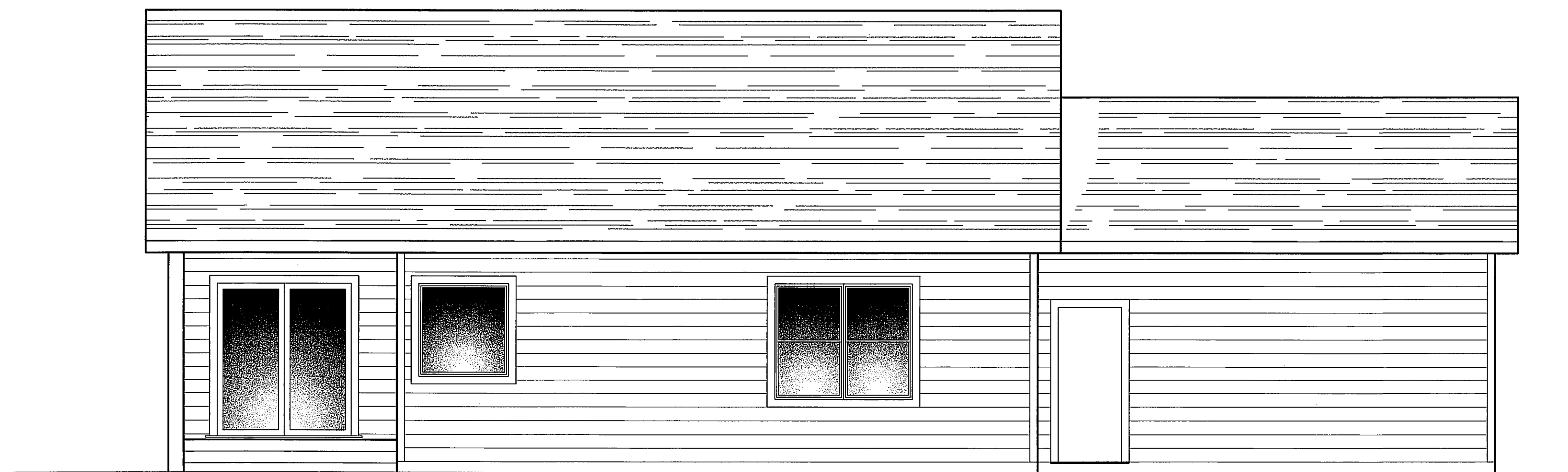
WEST ELEVATION SCALE: 1/4" = 1'-0"