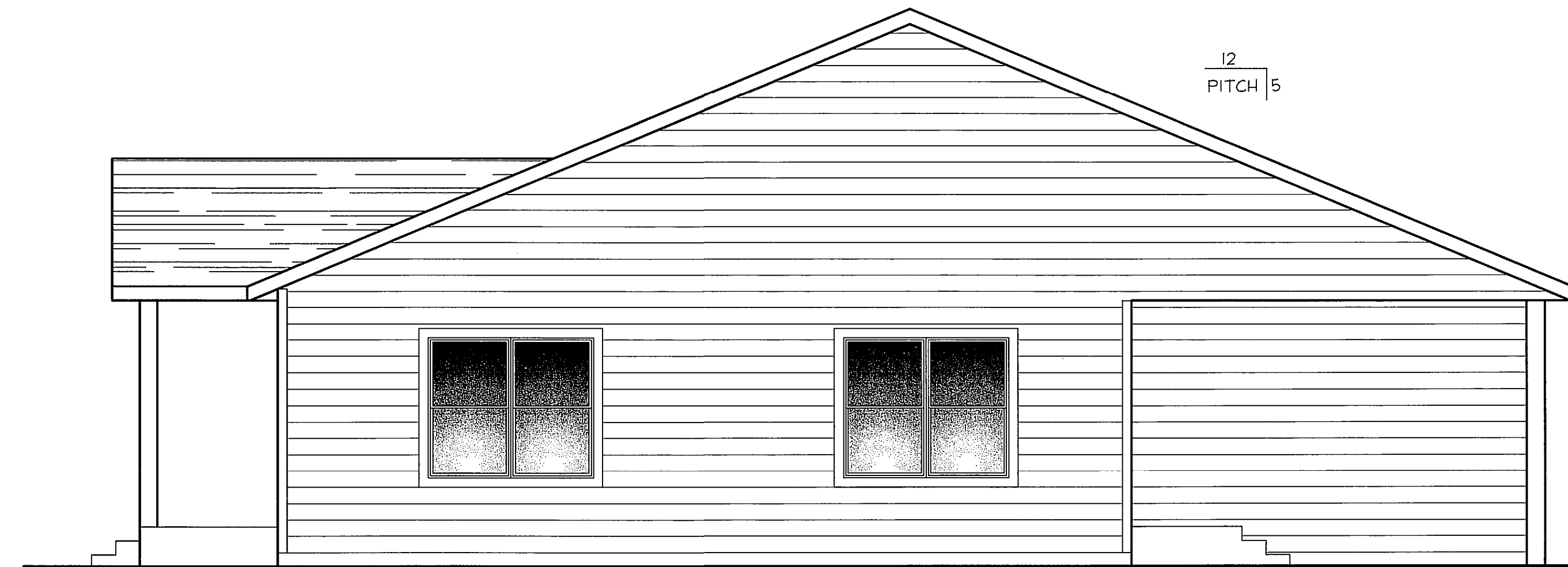
NORTH ELEVATION SCALE: 1/4" = 1'-0"