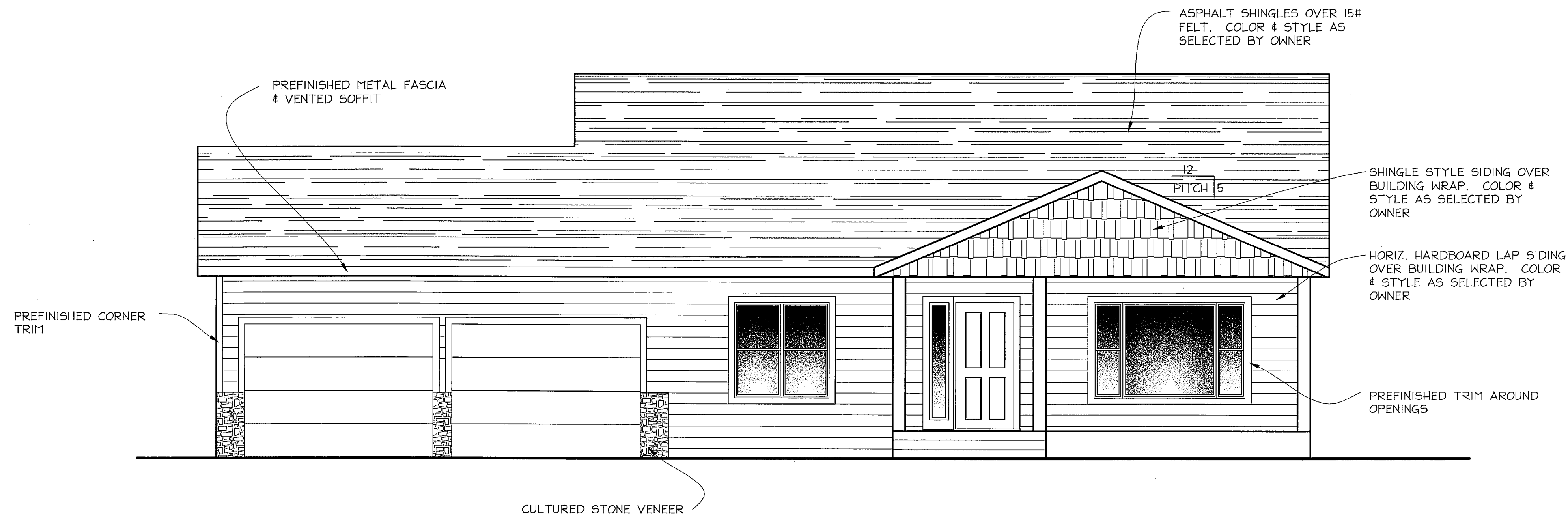
EAST ELEVATION SCALE: 1/4" = 1'-0"